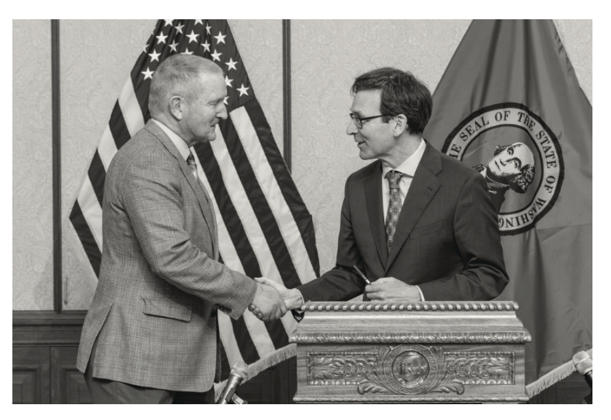
Bill sponsor Senator Holy and Governor Ferguson finalize SB 5306, effective July 27, 2025.

The legislature had a $12 billion shortfall in the state operating budget that led to